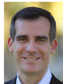
L.A. Mayor Eric Garcetti

Step right up, step right up -- VICA's annual Business Forecast Conference welcomes all to the economic "State of Confusion," the theme of this year's event, Friday, Oct. 16, from 7 a.m. to 2:30 p.m. at the Sheraton Universal. The event features a lunch-time keynote address by L.A. Mayor Eric Garcetti, a breakfast with three separate economic forecasts given by local, state and national experts. After the forecasts, guests will be able to check out eight panel discussions with experts in the fields of transportation, housing, water, earthquakes, live entertainment and the future of the news business. Click here for the complete list of our economists and panelists.